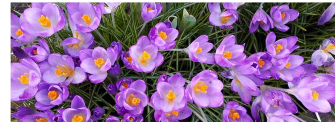
Crocus burst from bare earth soon in the new year

Emotionally, this is a month for mental cultivation as much as physical gardening. Practising patience, journaling about goals for the growing year, or simply appreciating the small signs of life returning can foster resilience. Nature reminds us that growth often happens invisibly before it blooms.