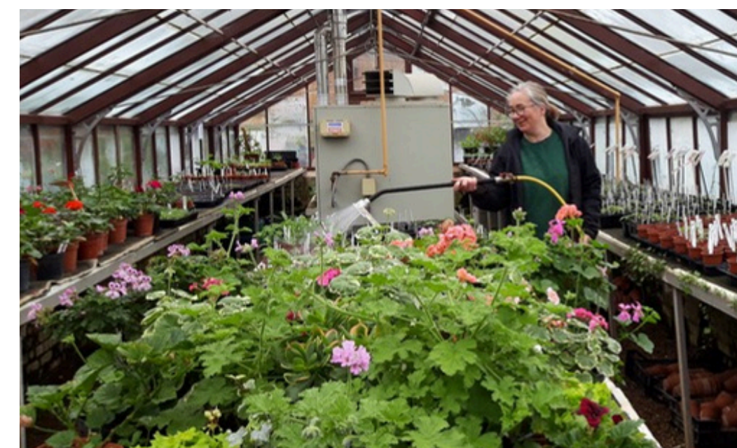
Keeping tender plants warm and early sowings under cover are part of the routine

As daylight slowly lengthens, February carries a quiet optimism. The first snowdrops and hellebores begin to appear, hinting that spring is on its way. Gardeners can use this month for planning and early preparation.