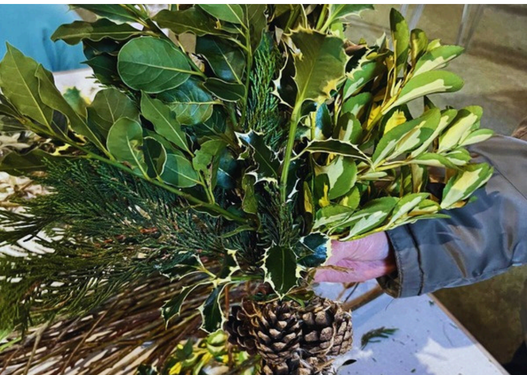
Creativity comes to the fore at festive community activity

Some of the children said they really enjoyed the tomato and basil soup and veggie stew, despite thinking they might not like it - highlighting how valuable our project is in making good nutritious food accessible and showing people how to make it tasty.