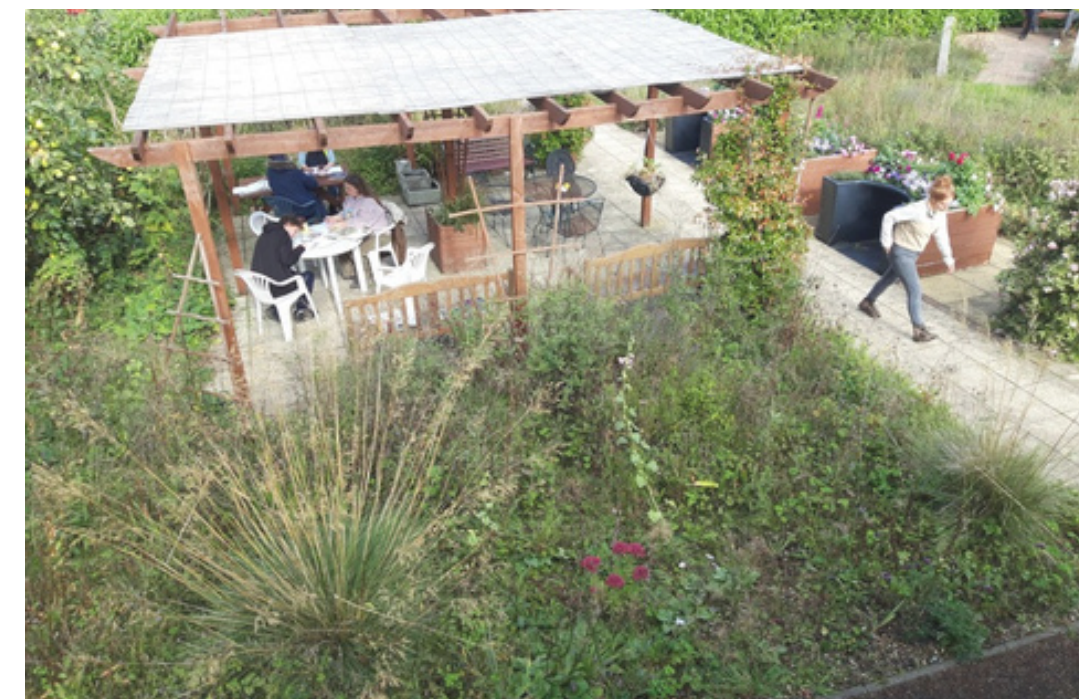
Grow Your Future welcomes new recruits