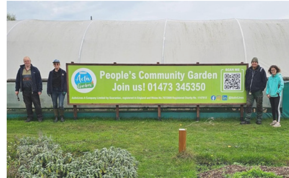
Volunteers at the People's Community Garden make a big difference