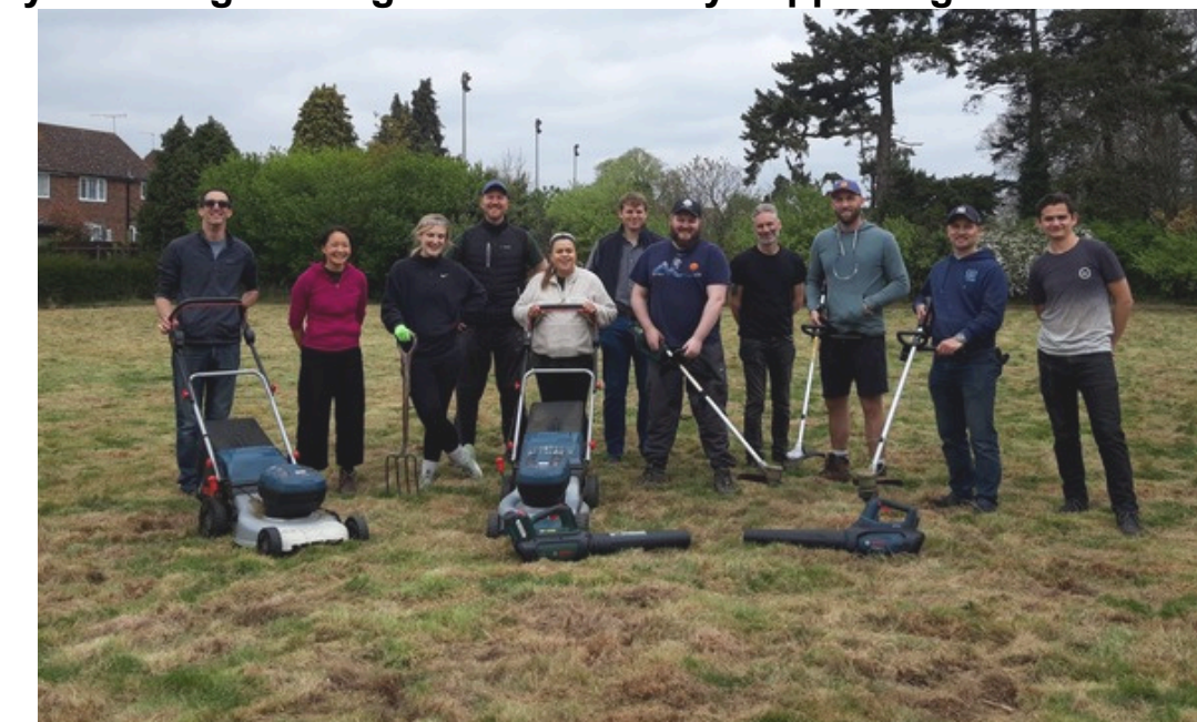
Mow holding back - Bosch team gives their all at a corporate team-building day