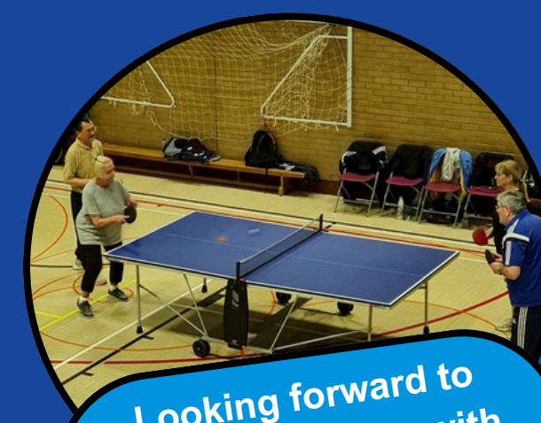
Looking forward to more milestones with community sport