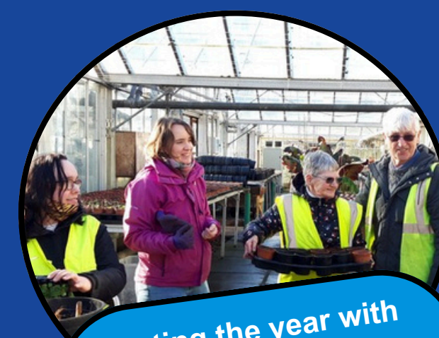
Starting the year with exciting activities in community gardens