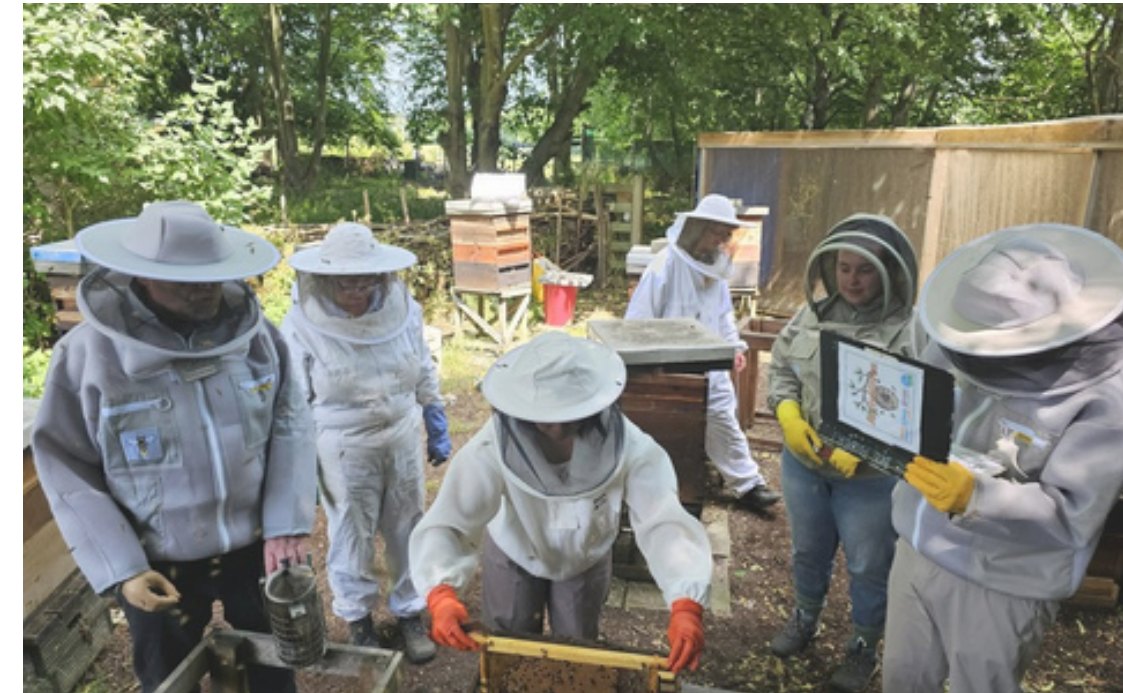
Beekeeping volunteers keep our bees buzzing