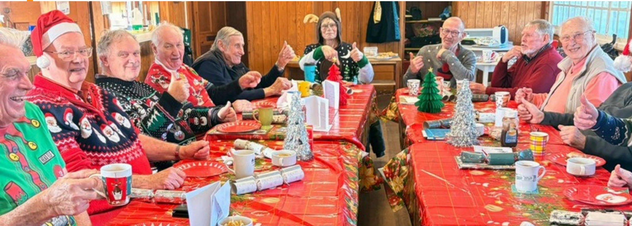
A festive celebration with Men's Hub members in Ipswich

We have now reached the end of 2025, for our weekly, Wednesday Morning Men's Breakfast Hub, in Ipswich; the hub has grown from strength to strength with new members joining us recently and next year it's been going for 4 years.