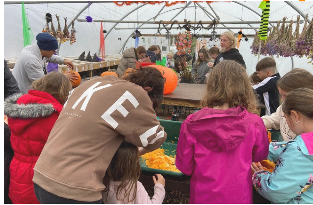
Families enjoy pumpkin carving