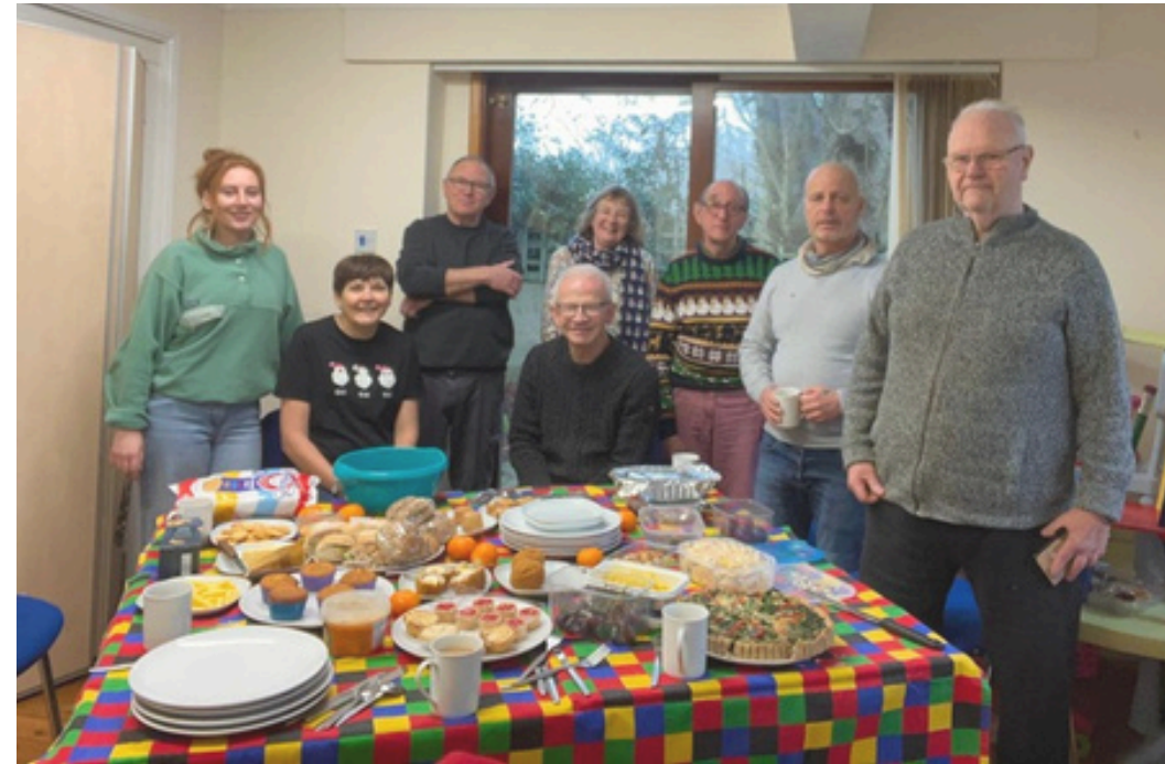
Sudbury volunteers enjoy their festive meal

We hope you enjoyed the break! Now here's to another healthy year of gardening in 2026!