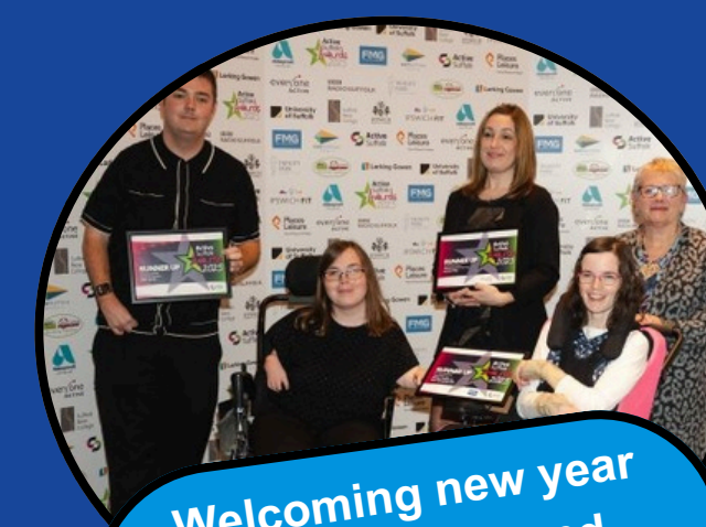
Welcoming new year with success and achievements