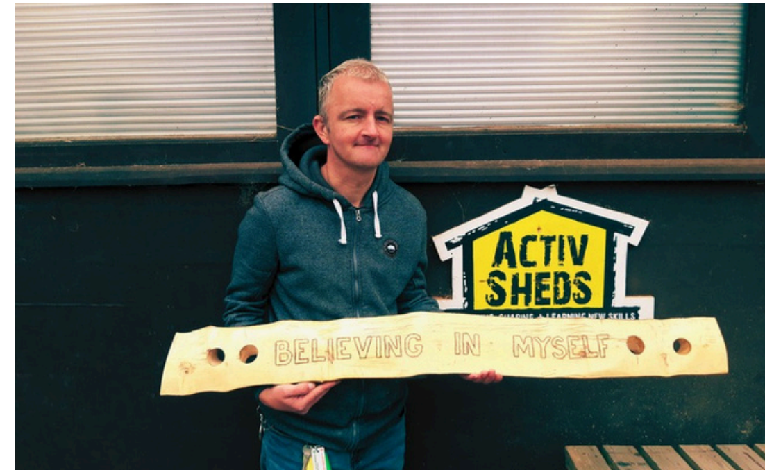
Feel like carving out a new path? – come and try out ActivSheds

You can try your hand at gardening, woodwork, beekeeping, nature conservation, or helping at events – get in touch with the team on 01473 345350 or email ian@activlives.org.uk