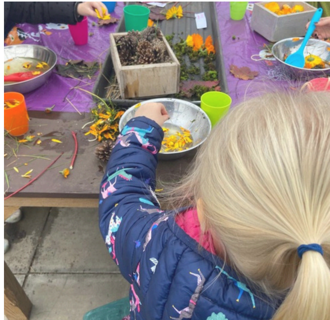
Edible flowers make pretty potions