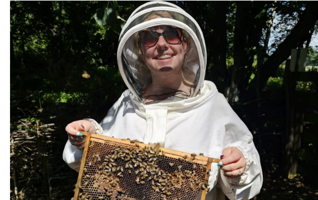
Come and feel the buzz at our community beekeeping project