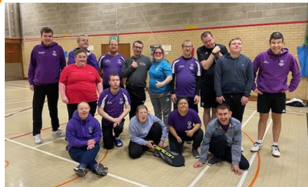
Twenty-four athletes competed in the Inclusive Badminton Tournament