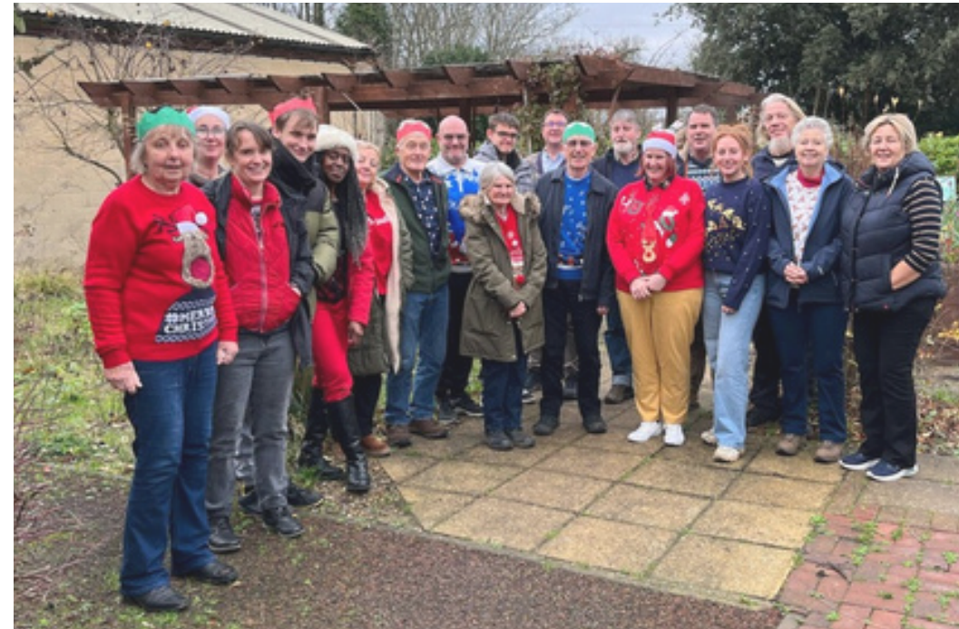
Christmas cheer at Chantry Walled Garden