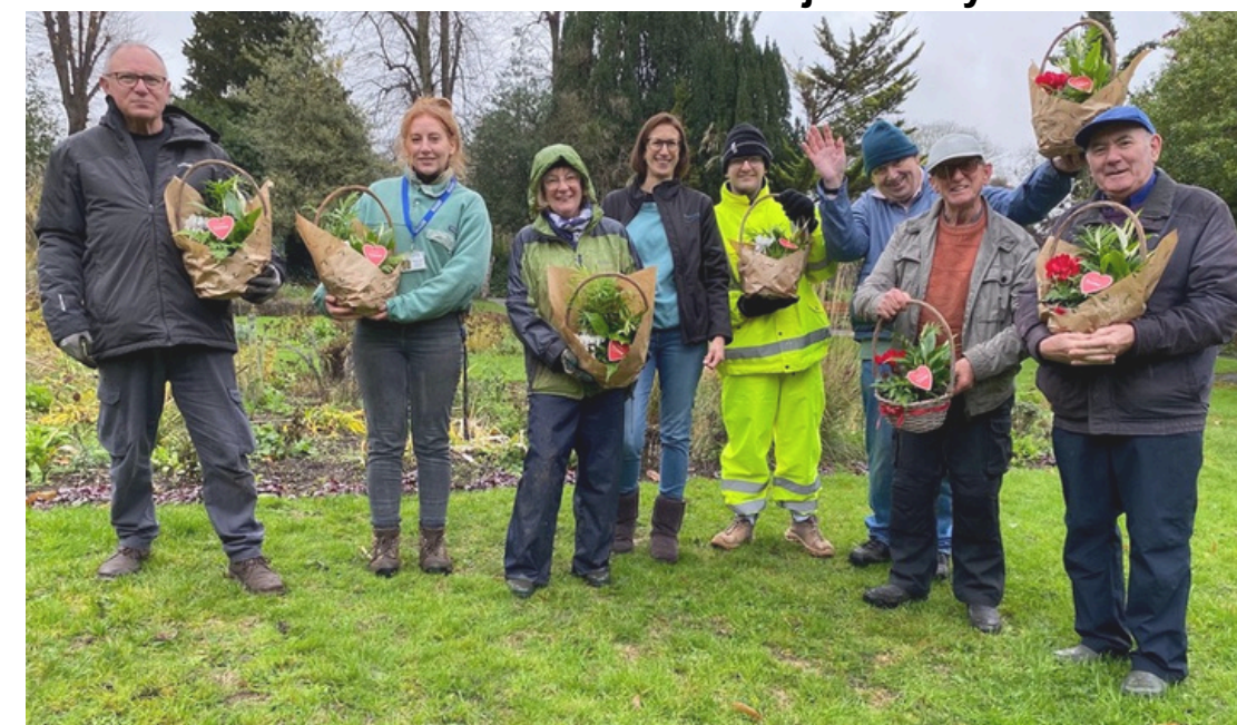
Perrywoods surprises volunteers with baskets of Christmas flowers as a mark of appreciation for their work