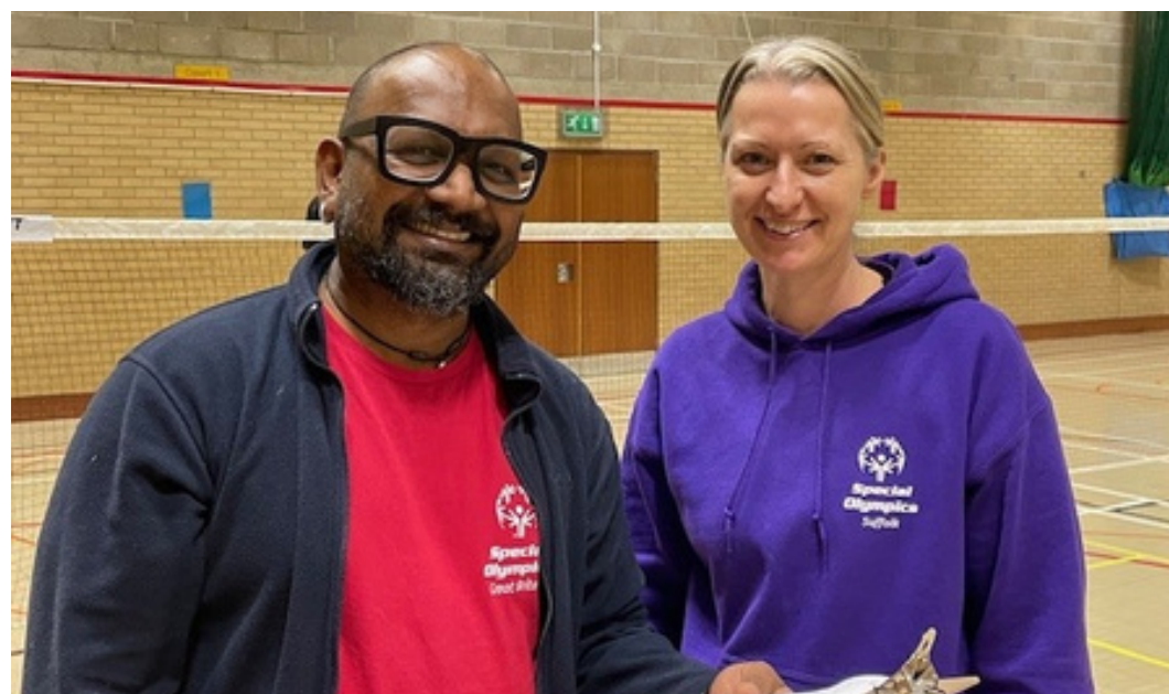
Thank you to our volunteers at the tournament!