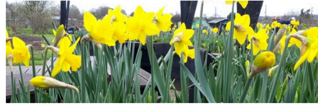
Daffodils herald Spring at the People's Community Garden

The first three months of the year can feel like the slow heartbeat of the gardening calendar. The days are short, the air is cold, and much of nature appears to be sleeping. Yet beneath the frost and quiet, life is quietly preparing to return. For gardeners, January, February, and March are not idle months but a vital time for reflection, restoration, and anticipation. These are months to nurture both the garden and the gardener's own well-being.