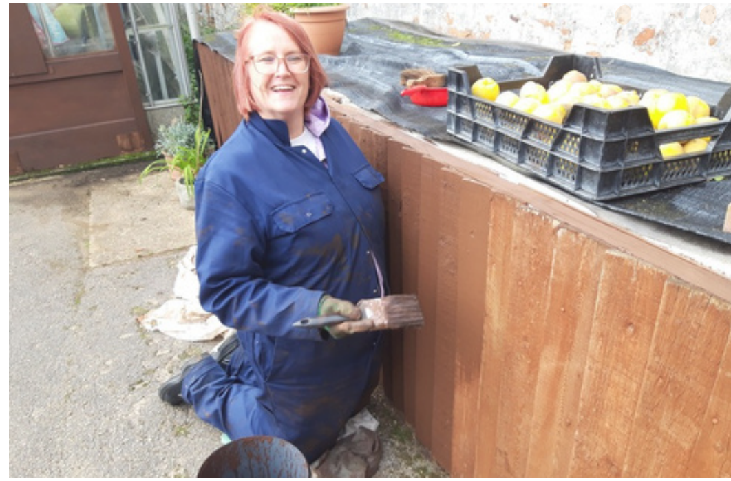
Grow Your Future member is proud of her achievements

Grow Your Future for people aged 16+ will help you gain skills and confidence for further learning, training, volunteering or employment.