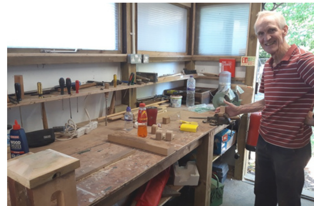
ActivSheds volunteers can turn their hand to anything