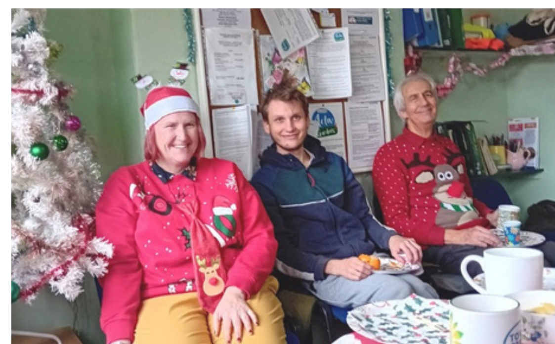
Time to relax and enjoy the party at Chantry Walled Garden